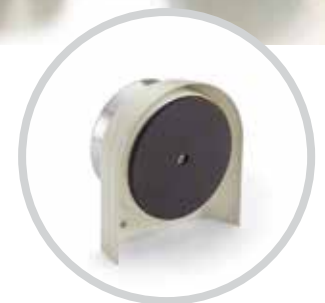
Handy magnetic back