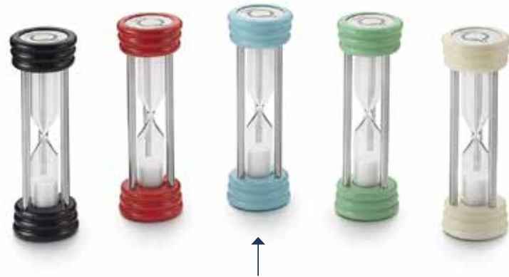
3 minute timers